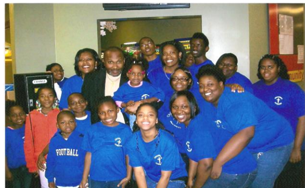
Music Ministry at CiCi's Pizza