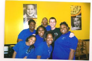
At work and play at Cici's Pizza